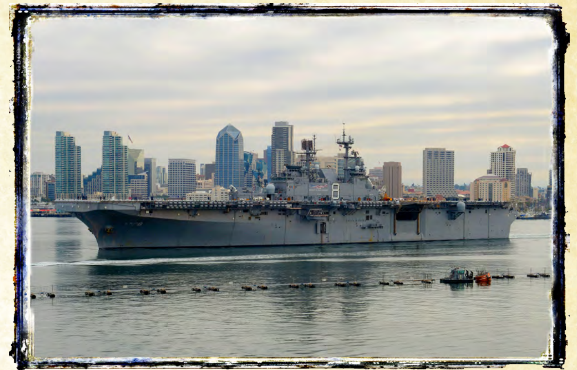
The amphibious assault ship USS Makin Island (LHD 8) transits San Diego Harbor.