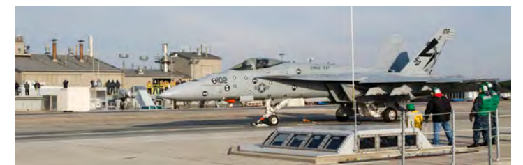
FIGURE 1. An F/A-18E Super Hornet prepares to launch during a test of the Electromagnetic Aircraft Launch System (EMALS) at Naval Air Systems Command, Lakehurst, NJ. EMALS is a complete carrier-based launch system designed for Gerald R. Ford (CVN 78) and future Ford -class carriers.

On February 18, 1999 the Integrated Power System Corporate Investment Board (CIB), composed of the NAVSEA and PEO organizational stakeholders, met to discuss the recent report and the strategy for funding the Corporate Development Program. A $503 million program schedule and budget was proposed. This proposal to stand up a new program with such a large cost was not well received by OPNAV, and was subsequently shelved.